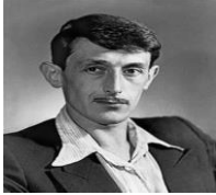
Victor Nekrasov (1911- 1987)

August was nearly over - the month of apples and falling stars, the last care-free month for the school children. The days were not hot, but sunny and limpidly clear - the first sign of advancing autumn.